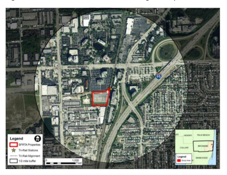
Figure 1: Aerial of SFRTA Site & Surrounding Development Patterns

Another objective of the Mobility Hub Master Plan for Cypress Creek includes identifying joint development potentials on the SFRTA-owned parcel that will enhance both mobility options as well as achieve other critical objectives, including: increasing Tri-Rail ridership and strengthening revenues for SFRTA, and growing the tax base of the City of Fort Lauderdale, surrounding jurisdictions, and Broward County.