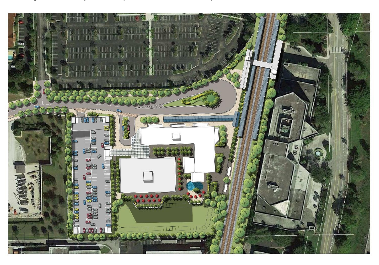
Figure 2: Concept Plan #1 (Site Plan Scenario 4A/B)

Based on the market study, multiple site plan options were created, including: a minimum buildout concept; a maximum buildout concept; a mixed-use concept; and, single-use concepts. In addition, in order to refine the site plans, evaluation criteria are proposed to better establish priorities and balance competing interests. The criteria have been grouped into the following six categories: Zoning and Land Use; Site Utilization; Project Phasing Potential; Surrounding Context Linkages; Vehicular Mobility; Project Image, Aesthetics and Urbanity, and Project Investment and Economic Factors. Of the multiple site plan options, two have emerged as potential/preferred candidates for development at the SFRTA-owned parcel based on the evaluation criteria. Each option is illustrated below: