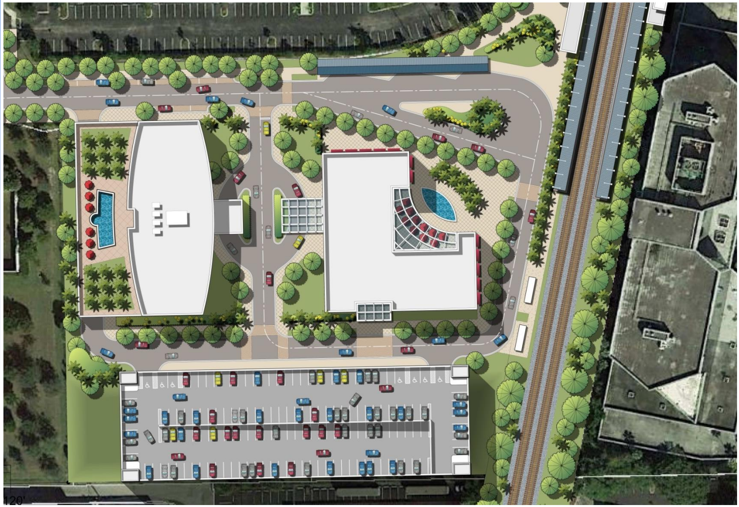
Hotel/Office – Scenario 4