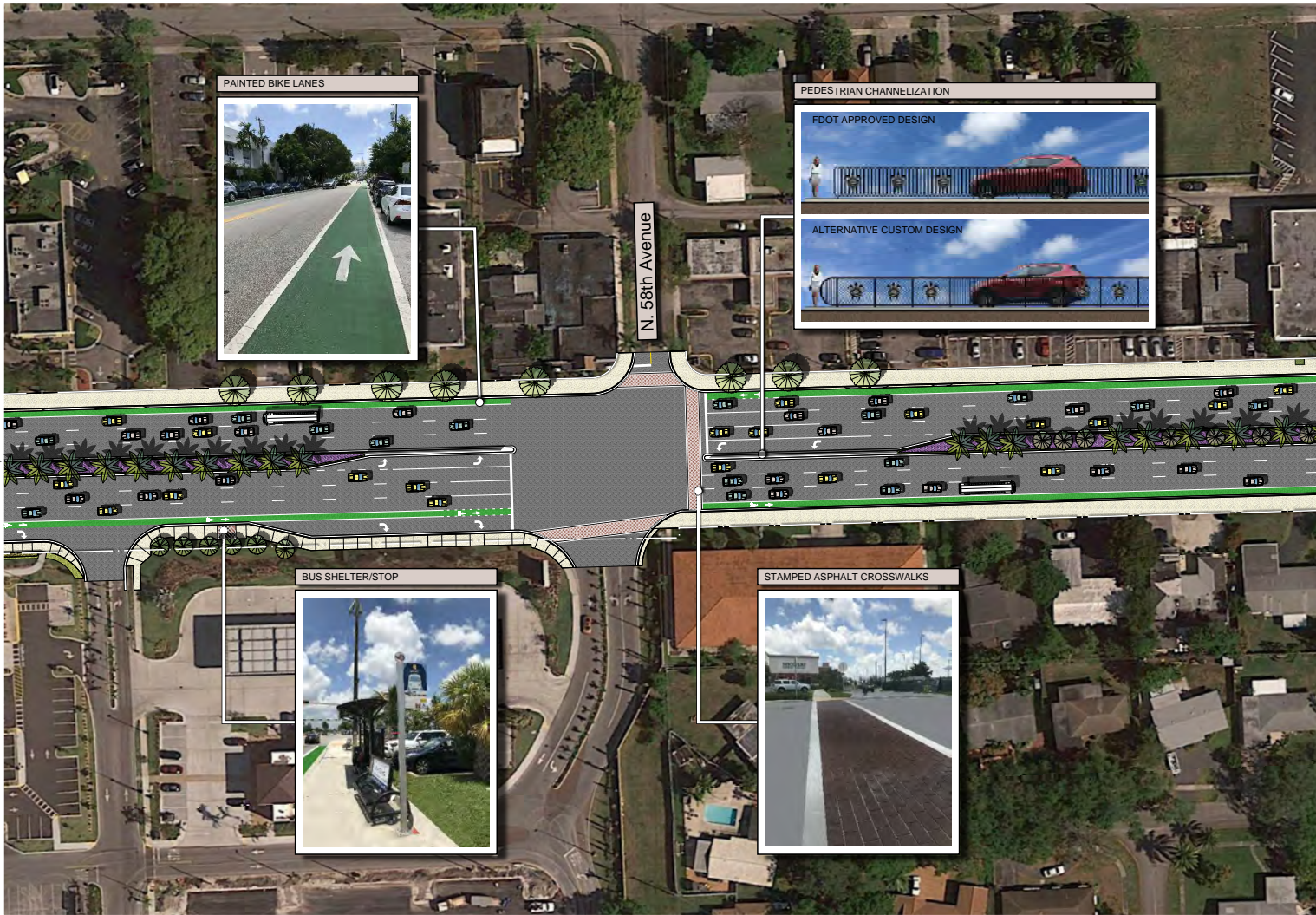
PAINTED BIKE LANES