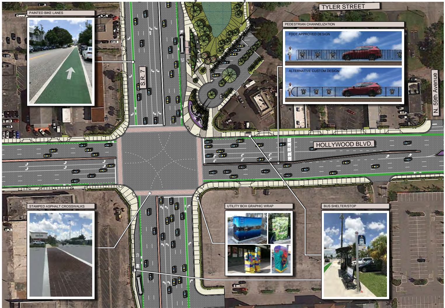
PAINTED BIKE LANES