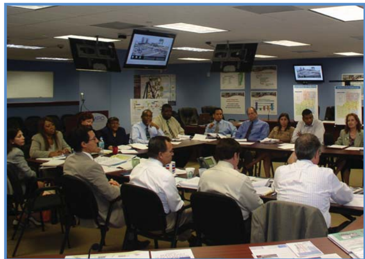
During the two-day site visit, members of the Federal Review Team sat down with Broward MPO staff members and partners, to take part in a Q&A roundtable session to discuss local transportation planning issues.

The MPO Board Members and staff would like to thank our partners who actively participated during the review process. Partners included representatives from Broward County Transit, FDOT, the South Florida Regional Transportation Authority, and Port Everglades.