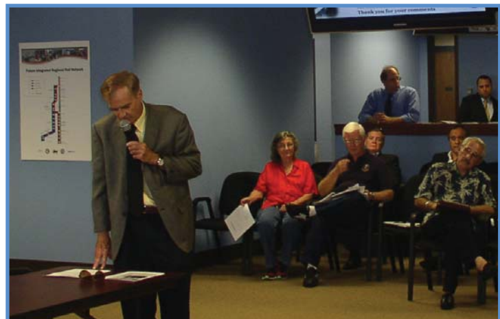
Several members of the public participated when given the opportunity to address the federal review team during the public meeting.