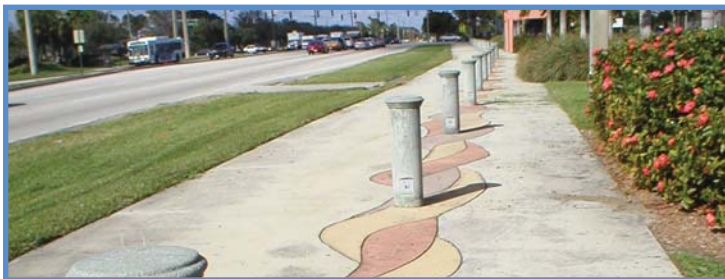
The Coconut Creek Parkway is the recipient of multiple grants to make positive changes for travel throughout the corridor, including sidewalk beautification.

Home to several educational campuses, the two-mile long Coconut Creek Parkway is a four-lane road with an open median that has been the subject of safety concerns. The City and its partners have developed a master plan for this stretch of roadway that will transform it into a pedestrian-friendly linear park. This includes pedestrian sidewalks with lighting for safety and beautification, and the construction of a neighborhood transit center.