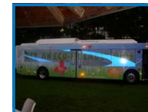
Broward County Transit's new diesel-electric buses will seat up to 38 passengers and feature modern, eco-friendly components.

of other tools to provide commuters with flexible options ( www.google.com/transit ).