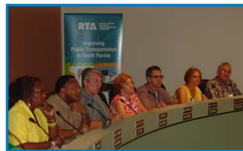
Representatives from Broward's CIR, Miami-Dade's CTAC, and Palm Beach's CAC served as the board of panelists for the 2008 meeting.