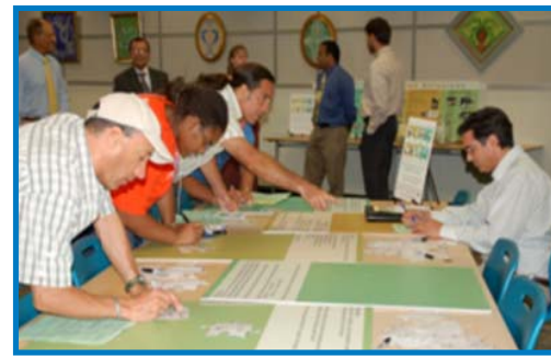
L RTP 2035 workshop held at South Regional Library in Pembroke Pines on July 29, 2008.

The Broward MPO is in the process of updating the current Year 2030 Long Range Transportation Plan (LRTP). The new 2035 LRTP will guide transportation investments in the Broward County area through the next 25 years with the purpose of achieving the best possible mobility connections in our transportation network.