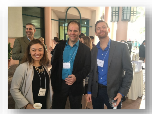
Safe Streets Summit 2017. City of Sunrise, FL.