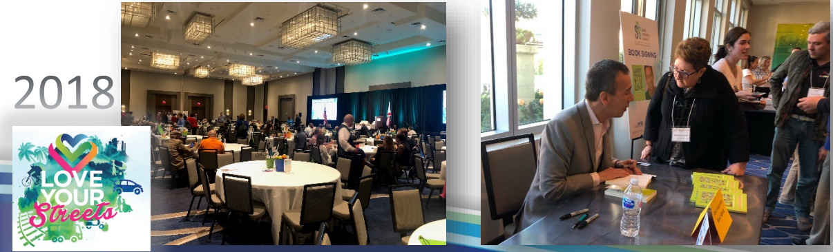
Safe Streets Summit 2018. West Palm Beach, FL.