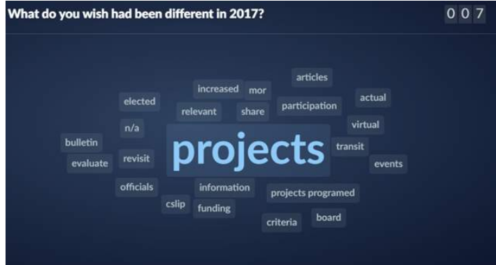
January 8 CSAC Meeting Polling Result

On Monday, January 8, 2018, the Broward MPO with the assistance of Kimley-Horn and Urban Health Partnerships hosted the first Complete Streets Advisory Committee (CSAC) Meeting of 2018. At this meeting Slido, an interactive polling element, was again incorporated into the meeting due to its success in previous meetings. This tool provided real time data to be collected and allowed for more people to have input in the meeting. Polling results and next steps have been included in this summary.