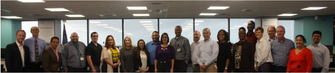
January 8 CSAC Member Photo 2018