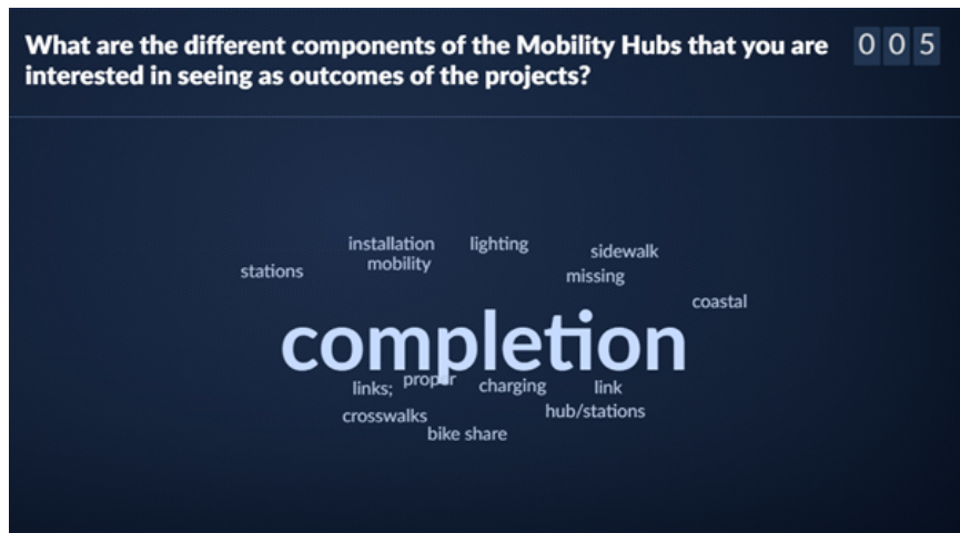
July 10 CSAC Meeting Polling Result

Member Comment: Continue to enhance Mobility Hub concepts along the TriRail Coastal Link and follow progress being made in Miami-Dade County.